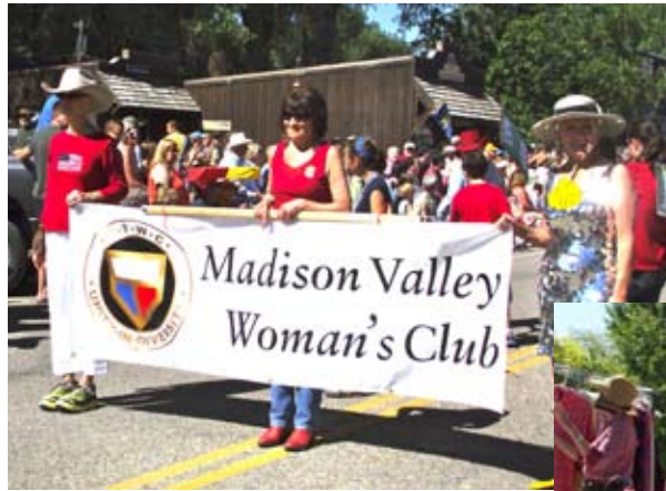
What has your club been doing lately?

This has been an annual project for many years and is a favorite club activity.