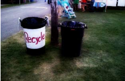
delivered a dozen bags of plastic bottles to the local recycle depot.