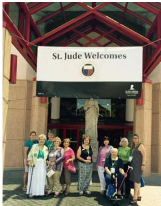
Right: St. Jude Children's Research Hospital welcomed GFWC members. What a great facility!!