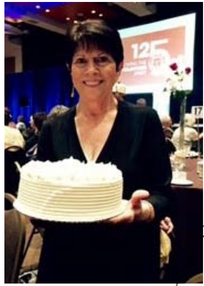
Right: A LEADS graduate presents a Birthday Cake at 125 th Anniversary Gala night