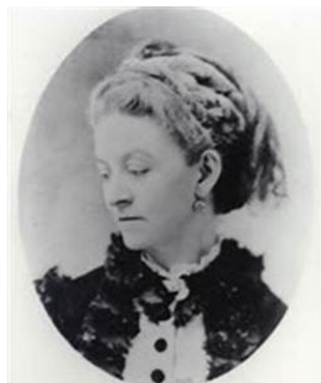
Jane Cunningham Croly