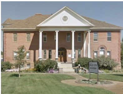
Perfect for a Princess Party!