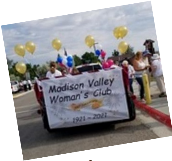
GFWC Madison Valley Woman's Club was honored to serve as Grand Marshall in this year's Ennis 4th of July Parade.