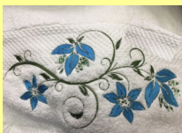
Embroidered Towel Set Thompson Falls Woman's Club

A few of the prizes were drawn at the Fall Meeting in October. Tickets are still available for the remaining prizes to be drawn at the Biennial Convention Spring 2022.