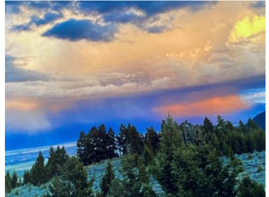
Natural Wonders Kim Montag Madison Valley Woman's Club

Here is a sample label for the back of your Photography Contest Entry