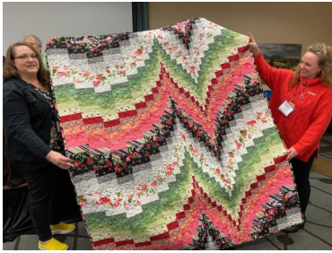
Back of the quilt won by Bitterroot Woman's Club

Many More pictures are posted on GFWCMontana.org