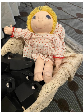
This cute young lady offered chances on gift boxes that might have a number for a prize.