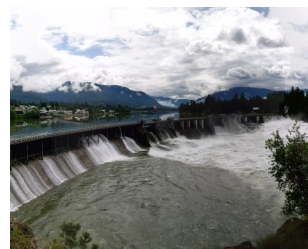
Thompson Falls Dam