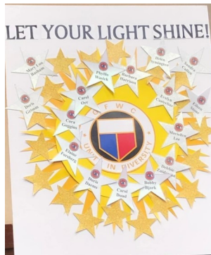
Memorial Service Stars in Progress -- we lost 22 of our "Stars" since the 2018 service.