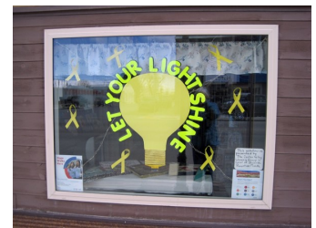
The Creative Closet fabric store window displays the uplifting message.

The club has used the funds to aid families in their community experiencing difficulties. This year they also made a donation to NAMI as part of their work within the President's Special Project.