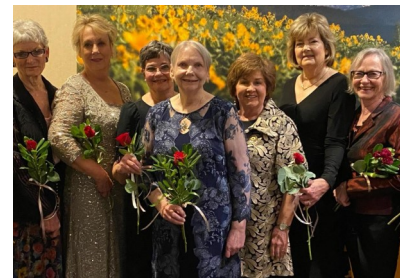
The newly installed Executive Committee stands ready to serve GFWC of Montana 2022-2024.